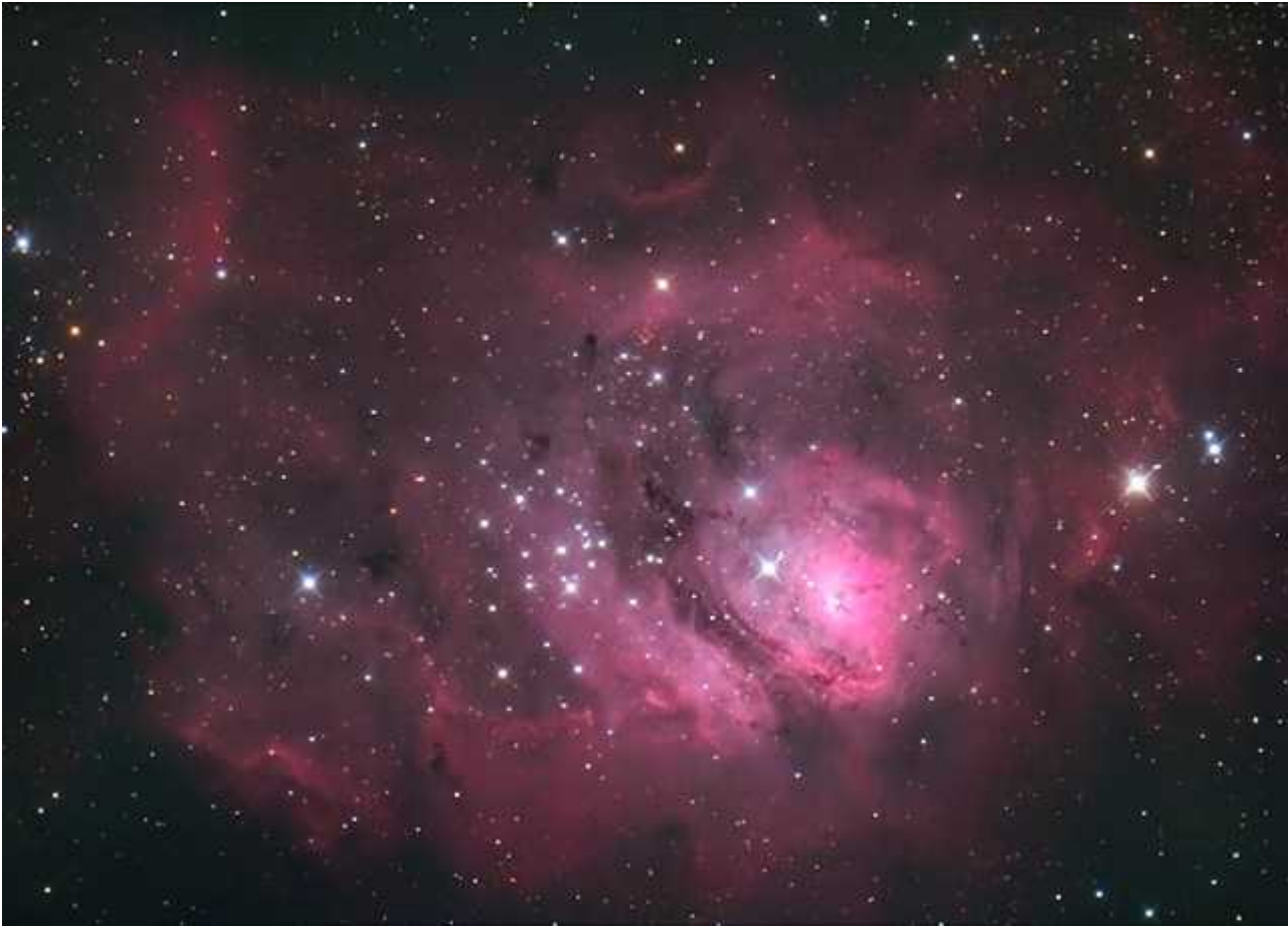
Photo above: Lagoon Nebula - canon 60da/6"astrotectRC f/9 heq5 5x150sec iso4000 Photo below: 6d 20mm f1.8iso2000 6secs