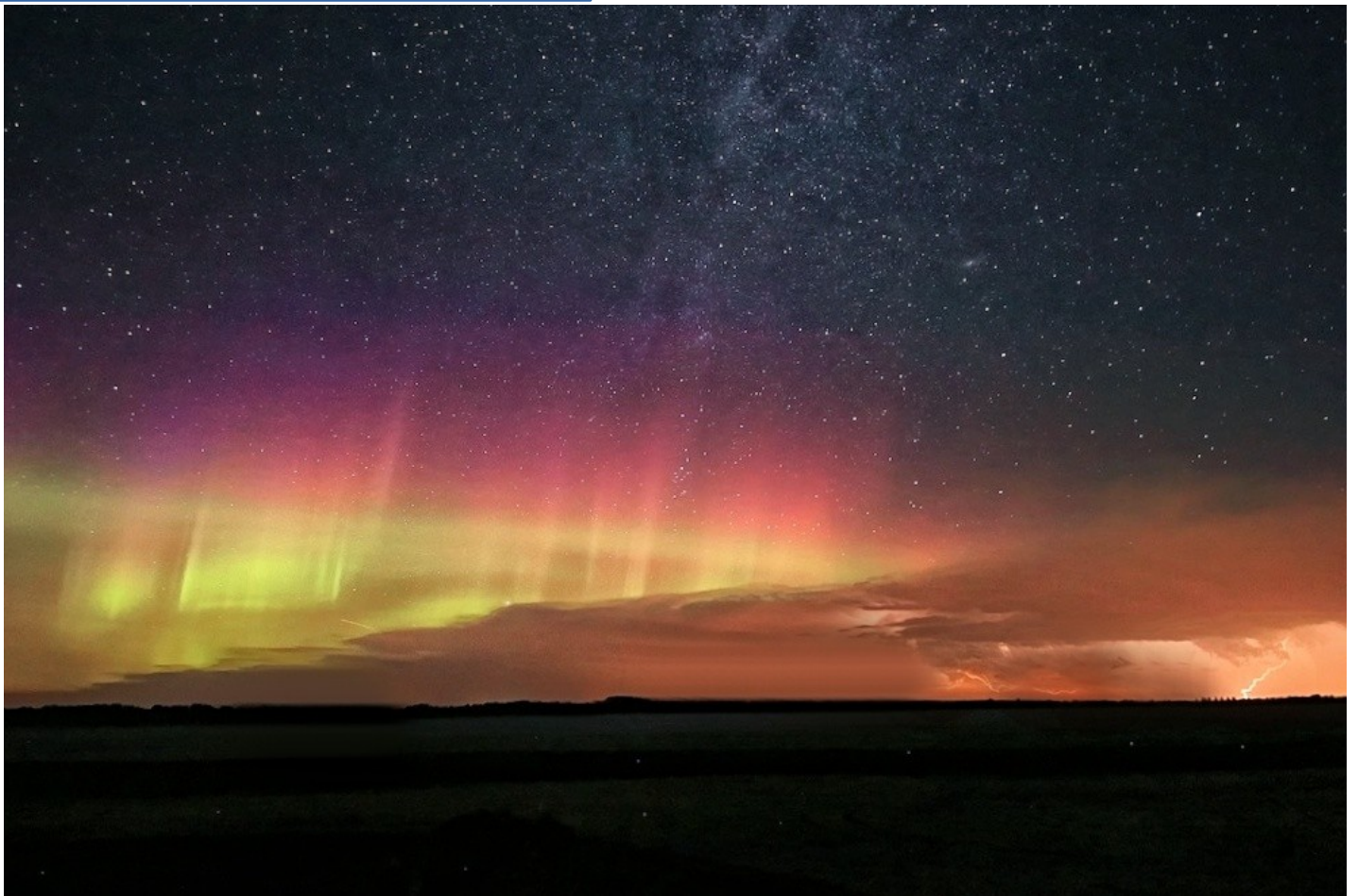
2 fabulous summer storms and aurora near Kaleida.