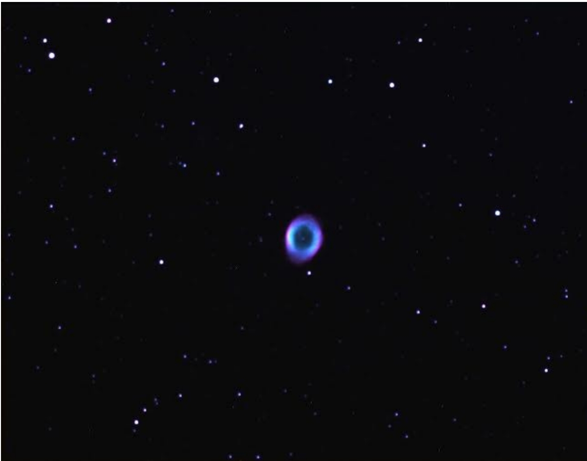
M57 using an Atik 428EX and EFW2 filter wheel with LRGB 36mm filters Below