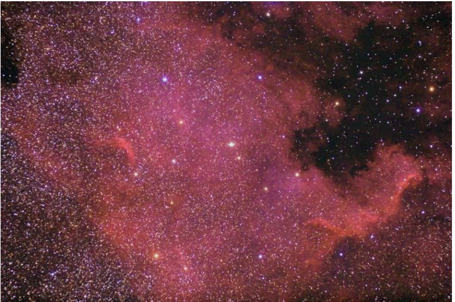
Imaged NGC 7000 from Seddons corner early Friday a.m. tried out my new Sky watcher ED80.300 secs...iso 3200 Above Photo by: Dave Moug (Winnipeg)