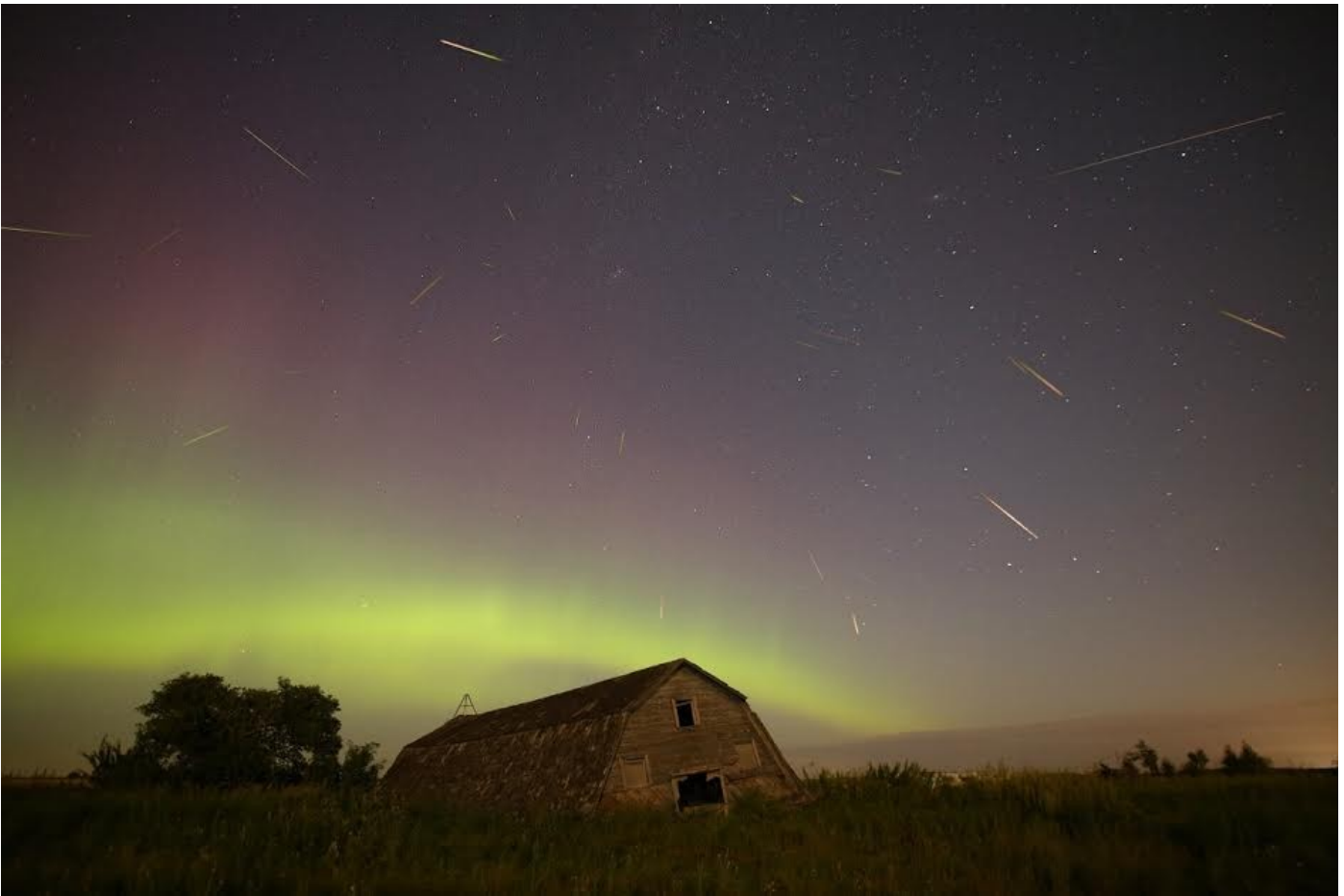
Perseids taken from abandoned yard by Oak Hammock Marsh